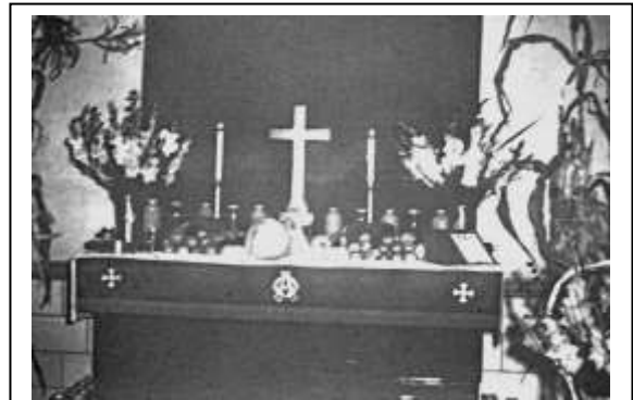
Harvest Home Alter 1947

Harvest Home continued as an annual service through the 1940s. There were a few revivals after that, but fewer members grew and preserved foods now, and the ways of collecting and donating food changed, culminating with our founding Manna on Main Street in 1980 as a year-round food bank. But for many years, especially during the Depression, Harvest Home was an important part of our St. John’s outreach, sharing God’s bounty!