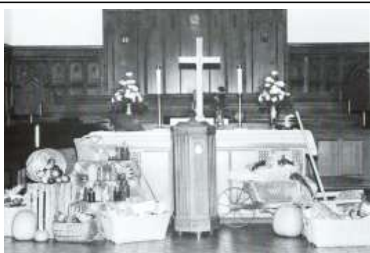
Harvest Home Calendar 2002